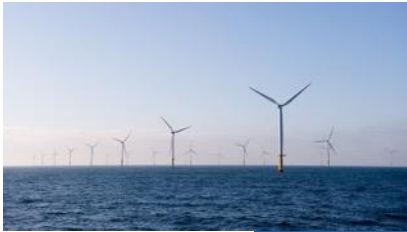
Borsele 1 & 2 Offshore wind