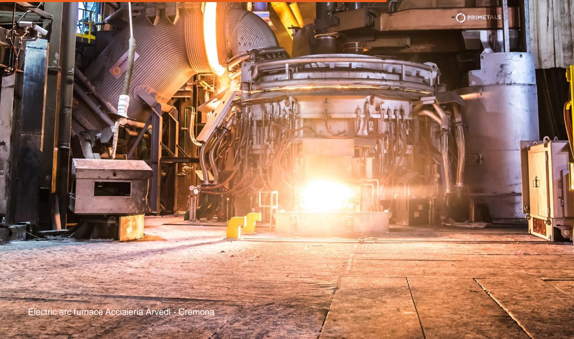
Electric arc furnace Acciaieria Arvedi - Cremona