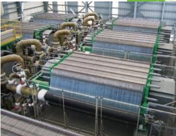
Hydrogen electrolyser (GW's)