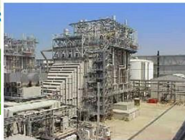
Dow Elsta Cogen (400 MWe)