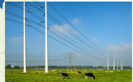
Missing 380 kV